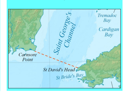
Figure 1. Location maps showing the South Wexford Coast.

The Celtic Sea is the area of the Atlantic Ocean off the southern coast of Ireland. The demarcation line or dividing line between the Irish Sea and the Celtic Sea extends from Carnsore Point in Ireland to Saint David's Head in Wales.